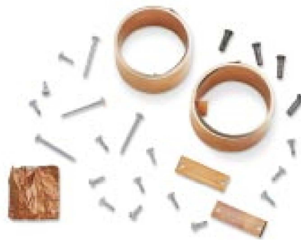
Includes CU-SPGP Accessories