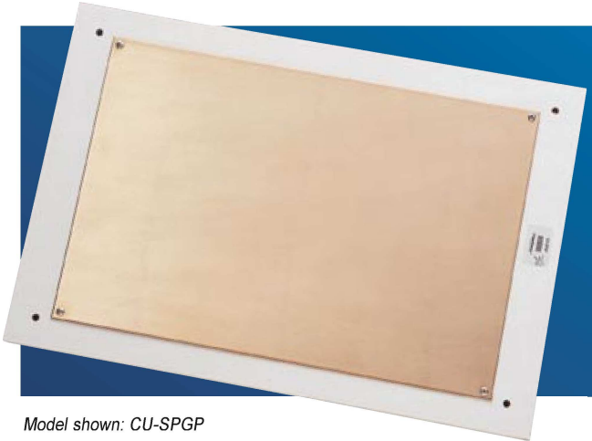
Model shown: CU-SPGP